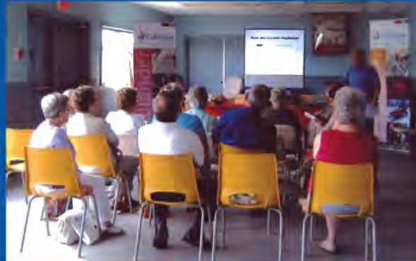
The Orton Room

The Orton Room , also located within the Callander Community Centre, is typically used to host meetings or small functions. It holds up to 100 people and offers a small canteen, tables & chairs.